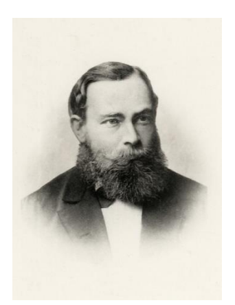
Gottlob Frege [3]

Jubilee Year 2025 - Highlights Frege exhibition, Schabbell Museum International Frege Conference Digital Frege Tours Frege events in schools Frege city tours